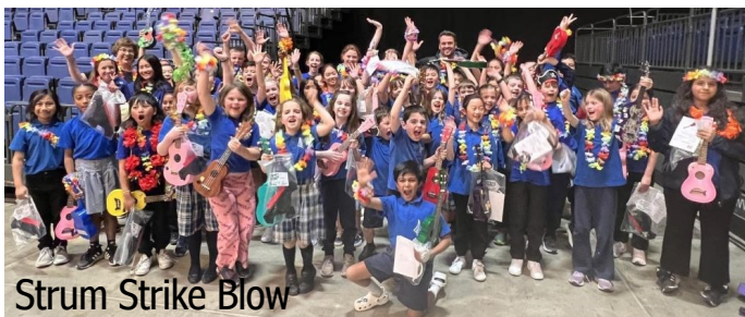
Strum Strike Blow

What a fabulous night! Congratulations to the Russley Ukulele Orchestra on an amazing performance at this year's Strum Strike Blow Festival. Hard work pays off — it was great to see you rocking it! Thanks too to the many Russley families who attended.